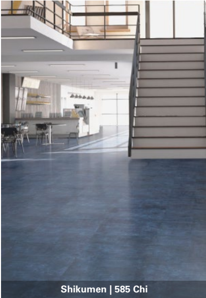
Shikumen | 585 Chi

Access the world through Mohawk Group's premier collection of heavy commercial luxury vinyl tile. Sereno and Shikumen are offered in two concrete visuals and an updated 18" x 36" rectangular format. The commercial grade wear layer and M-Force™ Enhanced Urethane Finish ensure these timeless LVT products perform through the life of the installation. Grant your projects Global Entry with Mohawk Group resilient flooring.